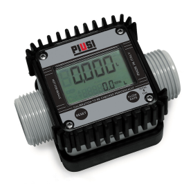
Digital flow meter for AdBlue K24