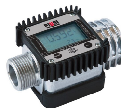
Digital flow meter for gasoline K24 ATEX

For diesel and gasoline. Water absorption and impurity filtration. Filter capacity 30µm. Flow rate 70 l/min.