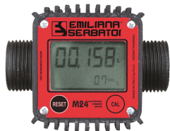
Digital fuel meter, mod. M24, for Diesel Fuel