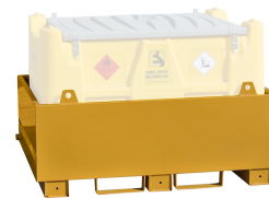
Retention Basin for Carrytank

Retention basin for ground use, 100% tank's volume capacity, made in carbon steel.