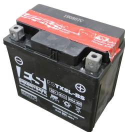
Lead-acid battery with battery charger (European plug type C)

For diesel and gasoline. Water absorption and impurity filtration. Filter capacity 30µm. Flow rate 70 l/min.