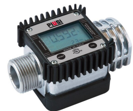
Digital flow meter for gasoline K24 ATEX

For diesel and gasoline. Water absorption and impurity filtration. Filter capacity 30µm. Flow rate 70 l/min.