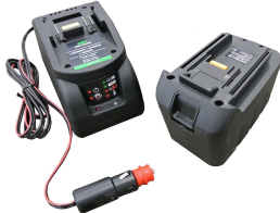
Manganese 12V battery with battery charger (cigarette lighter plug) and battery slot