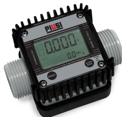
Digital flow meter for AdBlue K24