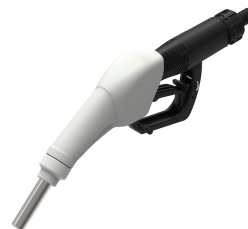
Automatic nozzle for AdBlue®