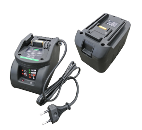
Manganese 12V battery with battery charger (European plug type C) and battery slot