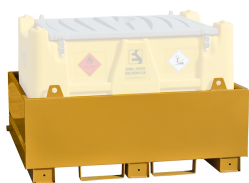
Retention Basin for Carrytank

Retention basin for ground use, 100% tank's volume capacity, made in carbon steel.