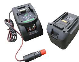
Manganese 12V battery with battery charger (cigarette lighter plug) and battery slot