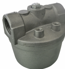
Strainer filter stainless steel

For diesel and gasoline. Impurity filtration. Filter capacity 60µm. Flow rate 50 l/min.