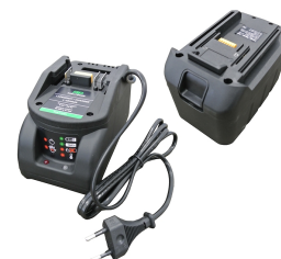
Manganese 12V battery with battery charger (European plug type C) and battery slot

For diesel and gasoline. Impurity filtration. Filter capacity 60µm. Flow rate 50 l/min.