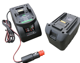
Manganese 12V battery with battery charger (cigarette lighter plug) and battery slot