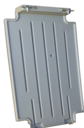
Lid for Carrytank 220

Polyethylene covering Lid, integrated in the tank's structure and manufactured in rotational molding.