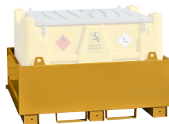
Retention Basin for Carrytank

Polyethylene covering Lid, integrated in the tank's structure and manufactured in rotational molding.