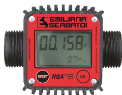
Digital fuel meter, mod. M24, for Diesel Fuel

Portable flexible spill containment tray