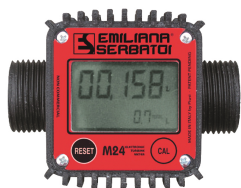
Digital fuel meter, mod. M24, for Diesel Fuel