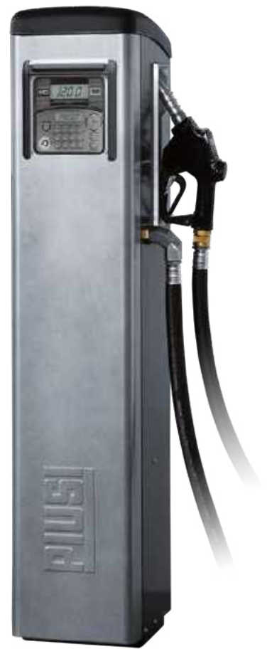
SELF SERVICE MC