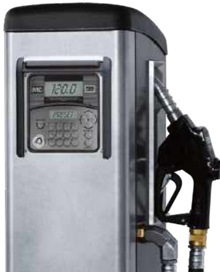
ELECTRONIC METER INTEGRATED