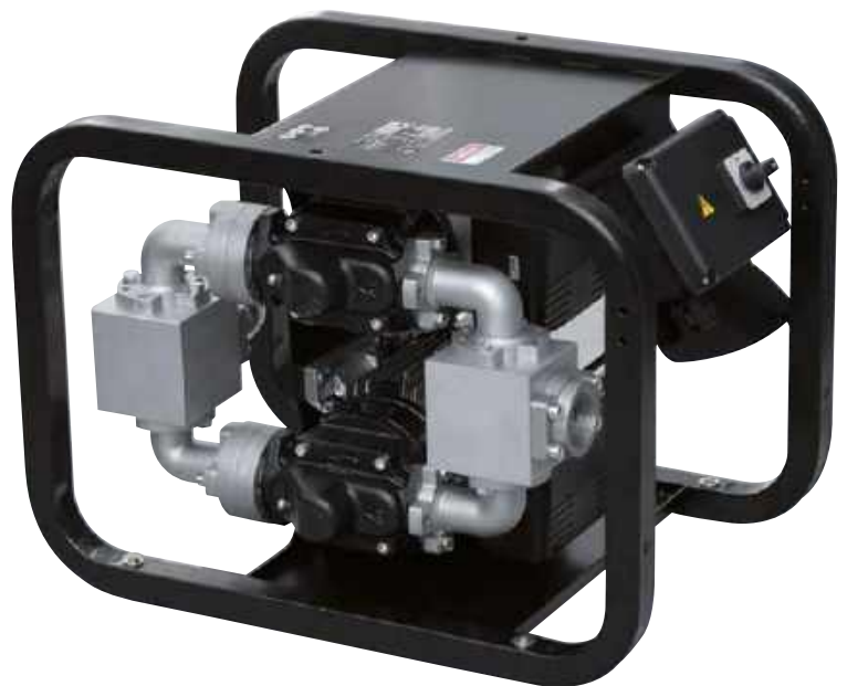
ST 200 AC