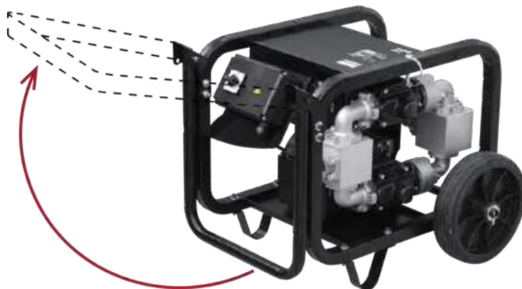
HANDY KIT: VERSION WITH WHEELS AND HANDLE