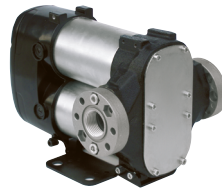
DC PUMP - BIPUMP