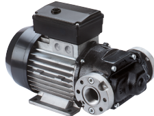
AC PUMP - E80/E120