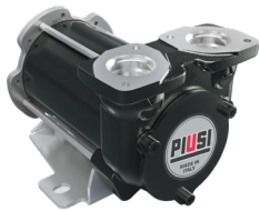
DC PUMP - BYPASS 3000