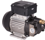
AC PUMP - VISCOMAT 70/90