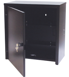
METALLIC BOX (optional)