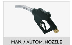
MAN. / AUTOM. NOZZLE