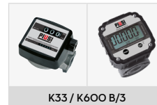
K33 / K600 B/3