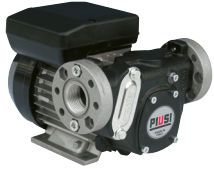
AC PUMP - PANTHER 56/72