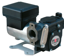
DC PUMP - PANTHER DC